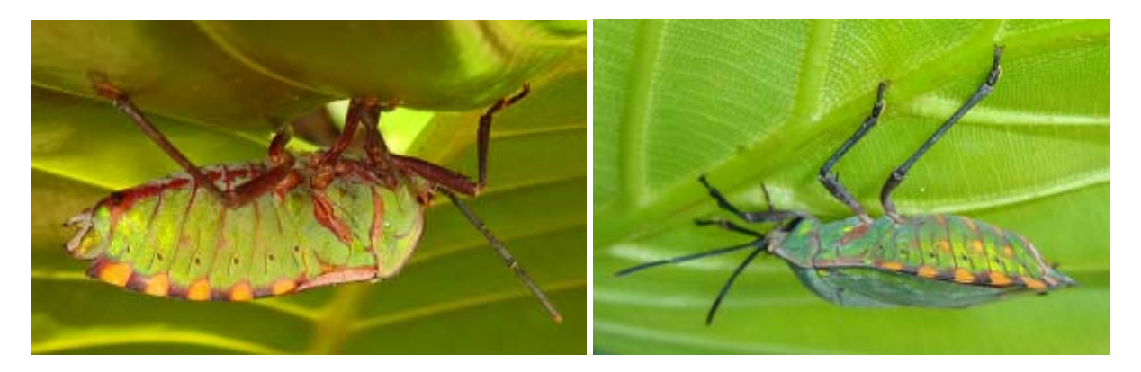
On 4<sup>th</sup> June 2011, a newly molted adult bug was spotted with its molted cast. The bug was presented with a light orange appearance. The most recent sighting of a newly molted bug in the same vicinity was on 9<sup>th</sup> December 2012 but without the molted cast around. This bug appeared to be in a more advance stage of molting judging from its darker colour.

Based on the orange patches on the underside of the bugs, the picture on the right below is a male bug while the one on the right is a female bug.