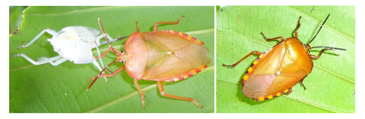
The nymphs undergo several stages of transformation that display different colours before reaching the adult stage. They are flat and near rectangular in shape having colours from red, orange to greenish-white.